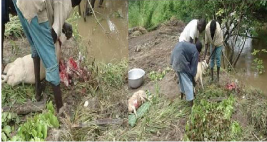
Fig. 2: Small scale miners slaughtering sheep to appease a River God near Dunkwa