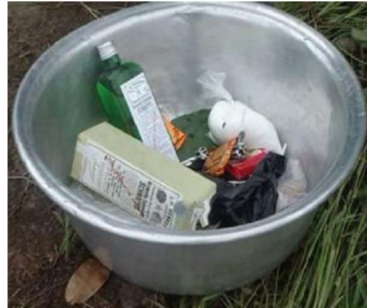
Fig. 4: Sweets for River spirit

Traditionally, women are not allowed to work in underground spaces in hard rock mining or in pits in alluvial operations. In addition, a woman in her menses is not allowed to go to the mining sites as it is postulated that river gods see such women as unclean. Furthermore, women are generally not allowed to wash and concentrate gold except in cases where it is a scavenging operation.