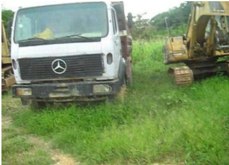
Fig. 3: Stuck equipment - resulting from refusal to pacify the River spirit

generally carried out close to rivers and streams. Since the earth itself and the rivers are considered sacred, protocols have to be observed. Some Ghanaians believe that the earth is owned by the Supreme Being who has demarcated specific portions to lesser gods. The chiefs and traditional leaders are the custodians of the land and when permission is granted for miners to work on the land, they are to observe customs and traditions.