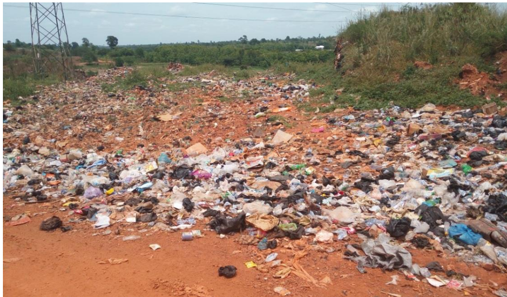
Plate 4: Open Dumping of Refuse at Rapid Road/GETFUND Junction