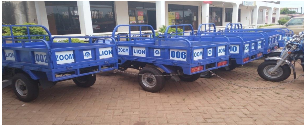
Plate 1: Tricycles for Solid Waste Management in Sunyani Municipality

solid waste management in the municipality had improved since the private waste management company was contracted. They collect, store and dispose waste from skip containers on time. Plates 1 and 2 show the tricycles and skip trucks for solid waste management in the Sunyani Municipality. This confirms responses of respondents that Zoomlion Ghana Limited had secured new solid waste management equipment.