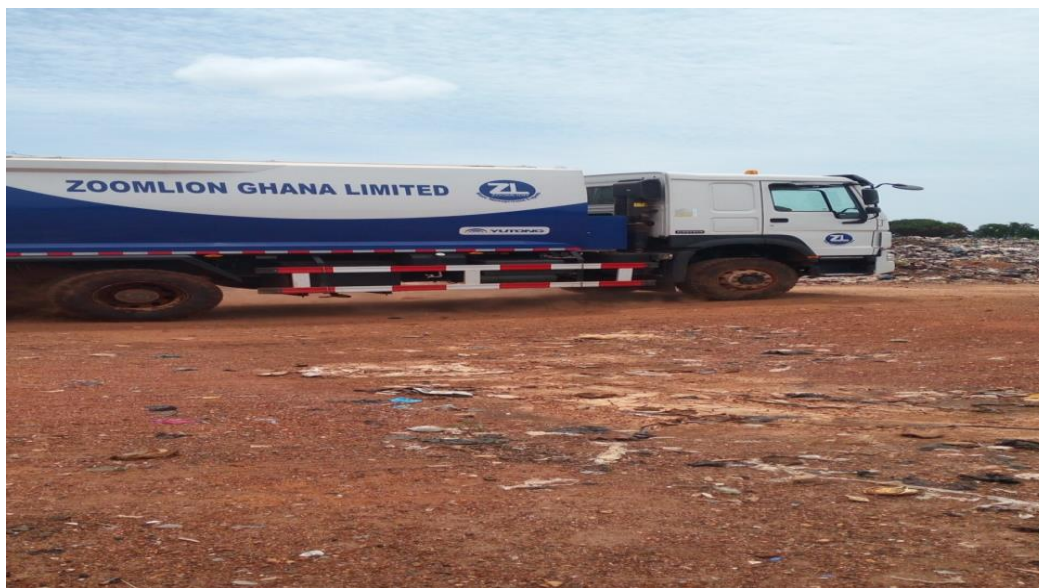
Plate 2: One of the New Skip Trucks for Solid Waste Management in Sunyani