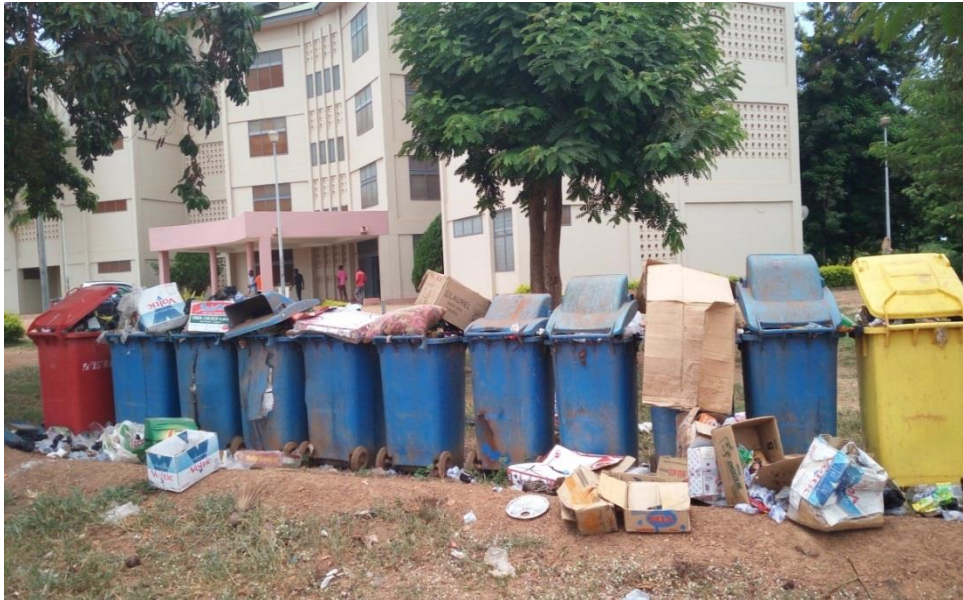
Plate3: Uncollected Solid Waste Containers at Sunyani Technical University New Site