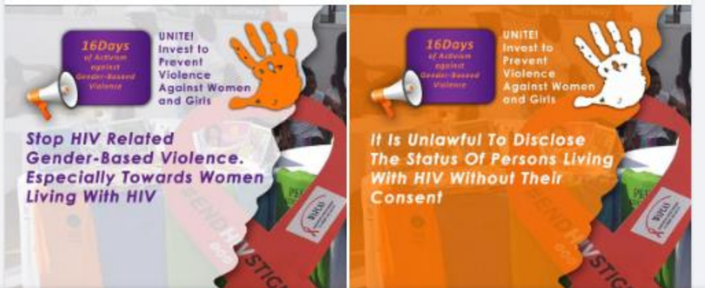
Figure 3: Facebook Post showing the use of Hashtags to Accompany the Advocacy Agenda of the Feminist Organization

HIV/AIDS remains a significant issue in Ghana. Although 87% of individuals living with HIV in Ghana are aware of their status, there still exists a significant gap in removing the stigma. #fightthegoodfight #16DaysOfActivism #wildafghana #EndGenderBasedViolence