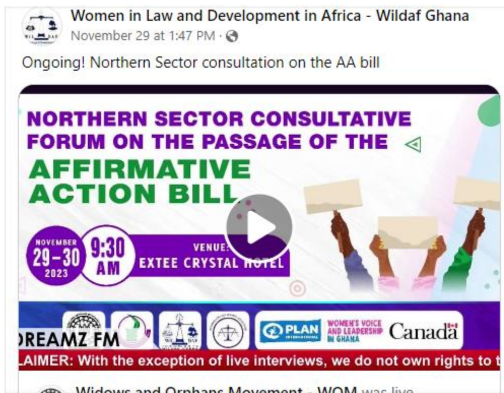
Figure 4: Picture of A live feed video of an event undertaken by WiLDAF.

rapid consumption of multimedia can lead to a superficial understanding of issues, as audiences might prioritize visually appealing content over in-depth discussions. This perspective suggests that while multimedia use can enhance engagement, it may also risk oversimplifying important conversations.