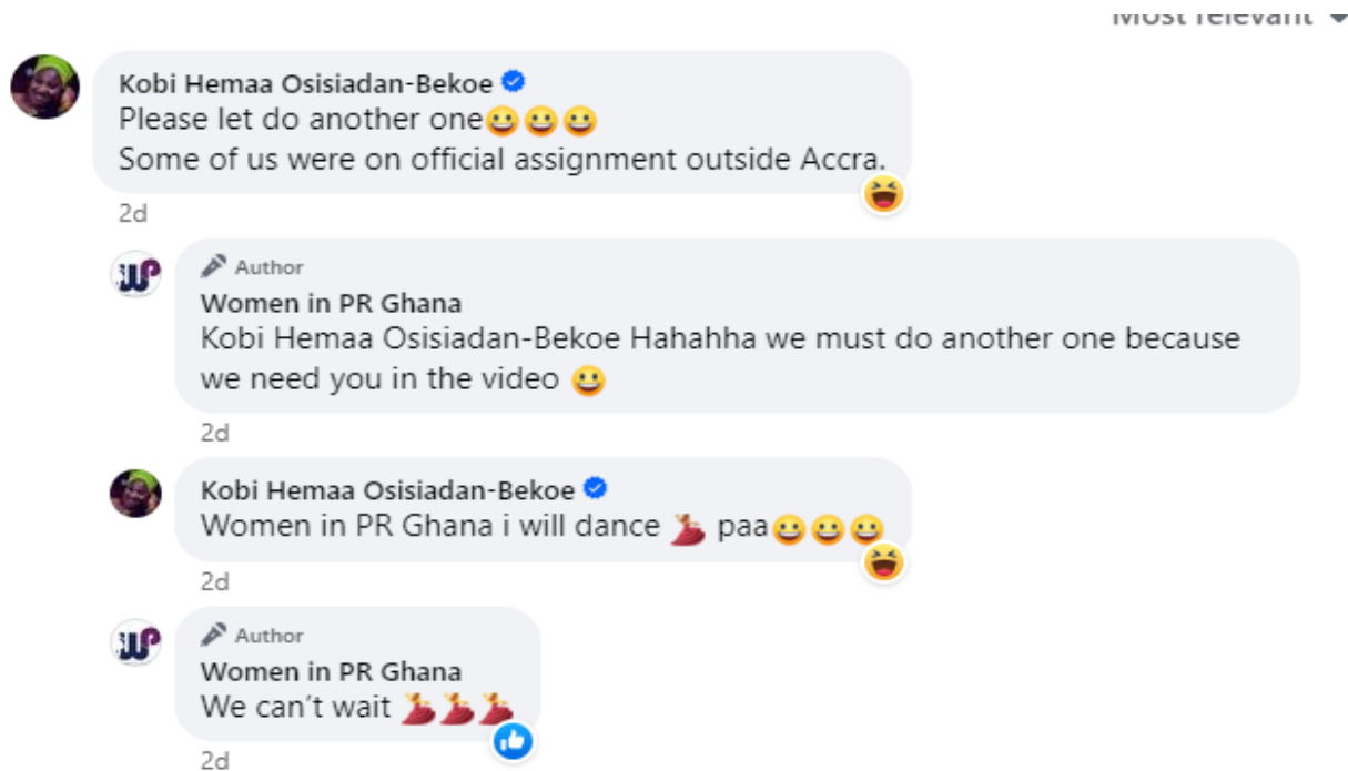
Figure 1: Picture of a conversation between WiPR Official Facebook Page and Facebook User.

The creation and maintenance of a virtual community is further actuated after the researcher follows the engaging content over some time. The study observed that there were a lot of similar responses under the comment section of the same post. The generation of this level of engagement and interaction was found to aid in the creation of a community that had gathered to discuss some issues of interest. It was observed that the Facebook handler had responded to almost all the messages that had been posted under the initial Facebook . This, essentially, goes to show the levels of engagement and interactivity that had been engaged by the organization on its Facebook page.