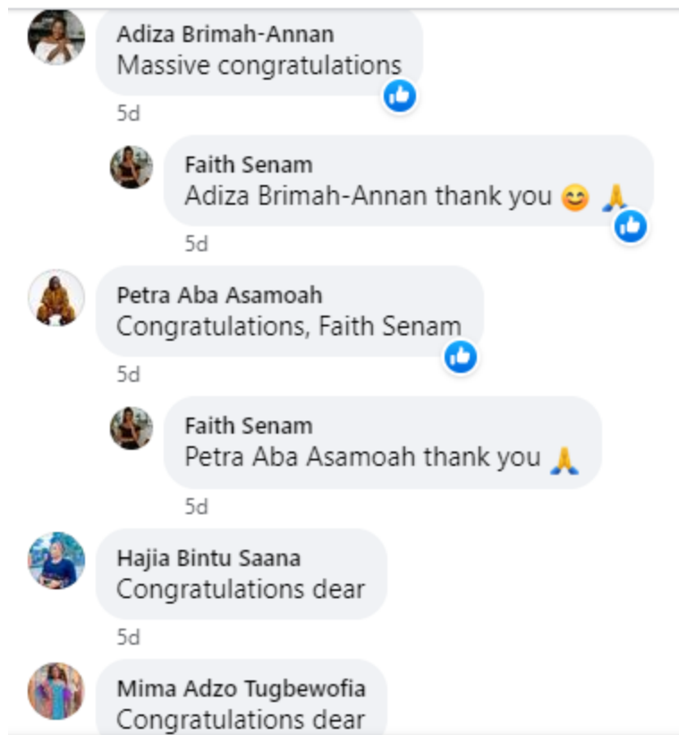
Figure 2: Facebook followers of WiPR congratulating a member of the community as a show of community building