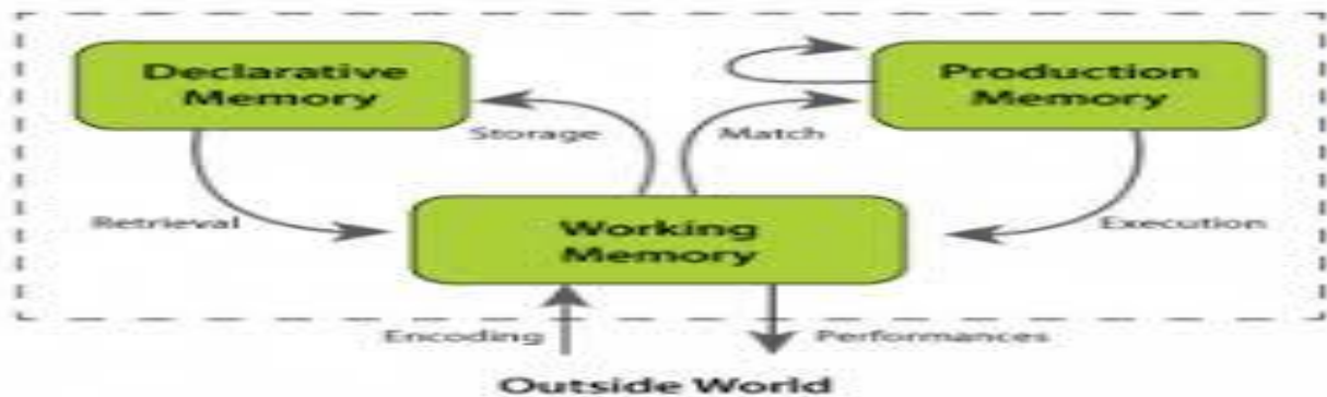
Figure 2.3 ACT-R Model